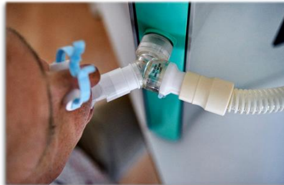
Exhale, hold your breath, inhale and then exhale

PEXA AB develops, produces and markets a research instrument to study respiratory diseases such as asthma and chronic obstructive pulmonary disease, COPD. The original idea and research behind the method comes from Anna-Carin Olin’s research group at the Unit of Occupational and Environmental Medicine (AMM) at the Sahlgrenska Academy at Gothenburg University and is based on a completely new method for collecting material from the small airways: particles in exhaled air.